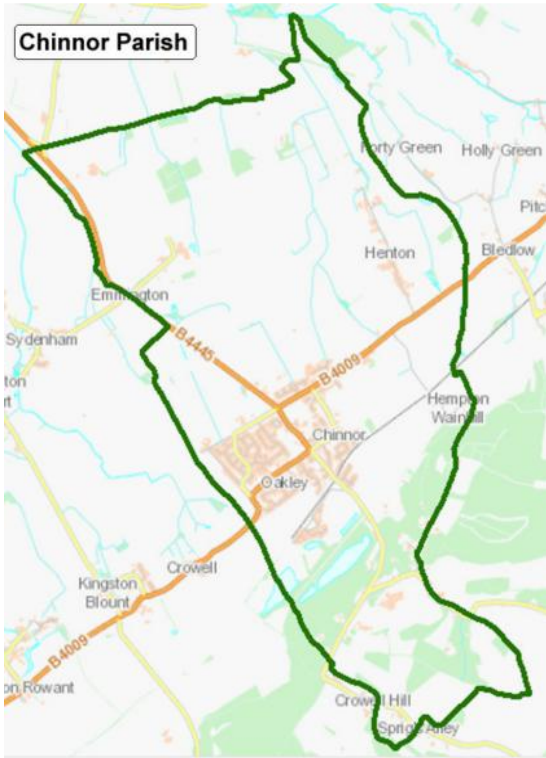
Figure 1: Map of Plan Area (Chinnor Parish)